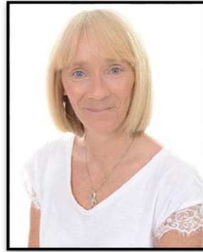
Vice - Principal