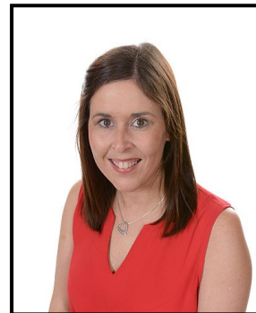
Year One Teachers