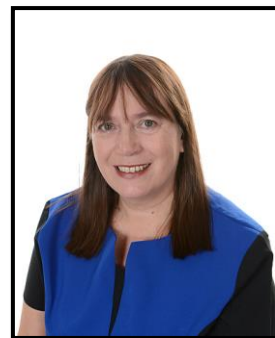
Year One Classroom Assistants