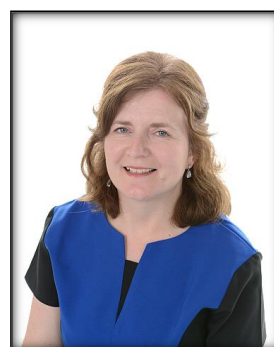
Nursery Classroom Assistants