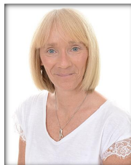
Vice - Principal